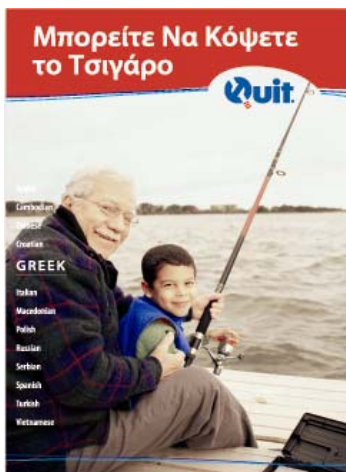
The Can Quit Book available in 13 languages.