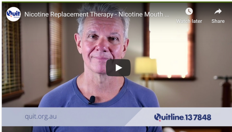
Click and watch the video to learn about nicotine mouth spray.

The nicotine mouth spray is a type of nicotine replacement therapy (NRT) that can be used to help you stop smoking. The nicotine mouth spray helps to reduce cravings and feelings of withdrawal by replacing some of the nicotine you would normally get from smoking. The nicotine mouth spray is often used together with the nicotine patch, which is a long-acting type of NRT, to help you quit. Watch the video and read the information below to learn about the nicotine mouth spray and how to use it to help you stop smoking.